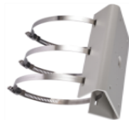
DS-1275ZJ-SUS Vertical Pole Mount