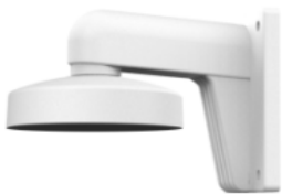
DS-1273ZJ-140 Wall Mount