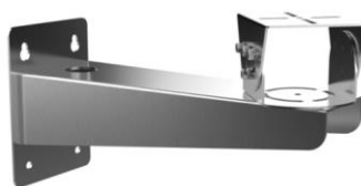
DS-1701ZJ Wall Mounting Bracket