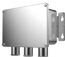
DS-1284ZJ-M Junction Box