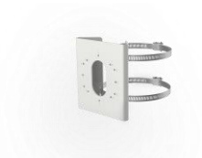
DS-1275ZJ-S-SUS Vertical Pole Mount